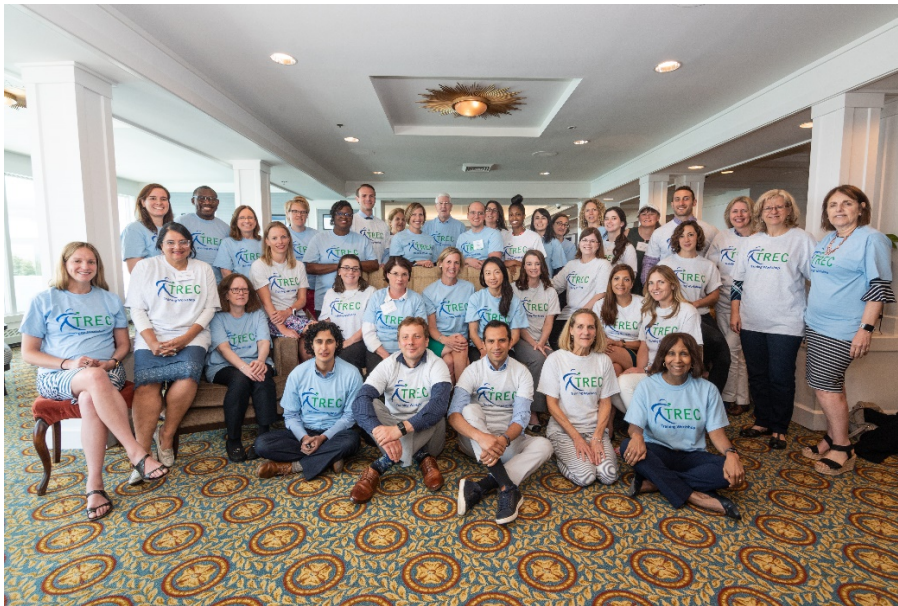
Year 3 - 2019