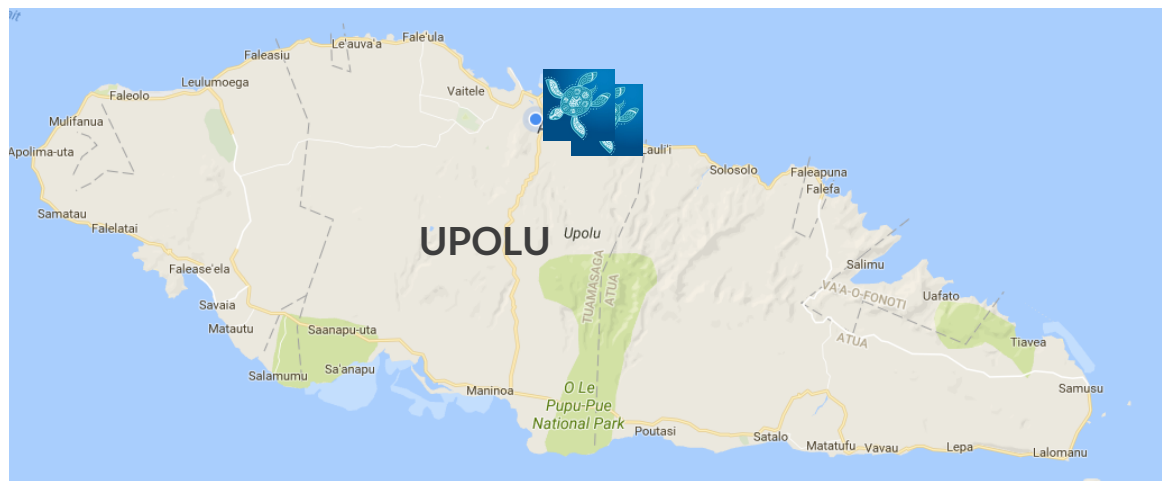
Faafetai tele lava Fagalii ma Moata'a mo le avea ai lea ma Afioga muamua i lenei Su'esu'ega.