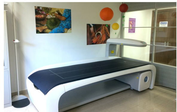
Our new iDXA scanner

Our new home is located on the first floor of the Ministry of Health building. We are so excited to be here, and we're especially excited about our newly installed iDXA scanner, which we will be using to measure bone, fat, and lean mass in our study participants. The lab is also equipped with (cont. on p. 2)