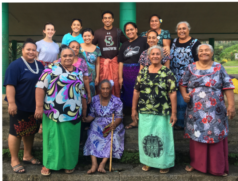
Vaega Su'esu'e ma nisi o Sui o le Komiti a Tinā i Lotofaga i le mae'a ai o se tasi o aso matagofie. Toe feloa'i i le 2019!

nei na auai: Lepea, Moata'a, Magiagi, Tuana'i, Falefa, Solosolo, Lotofaga, Utuali'i ma Sale'imoa. O se vaega e to'a-84 o le 'Ola Tuputupua'e' na latou taulimaina le masini e pei o se uati (accelerometers) mo le vaiaso atoa aua le fuaina o a latou gaioiga poo galuega faatino, a mae'a lea, ona aumai lea i la matou ofisa mo le faatinoina o le fa'ata poo le (iDXA,) e mafai ai ona iloa ni faamatalaga e faatatau i le maloloina o a latou ponaivi ,ga'o ma le faatulagaina o musele o le tino. O le agaga o le fiafia, ona o i matou o le vaega muamua ua mafai ona faatinoina le fa'ata (iDXA) i Tamaiti o le Atu Pasefika! O loo tuufaatasia le faai'uga o la matou suesuega leni, a ma'ea ona faao'o atu lea i Afioaga ta'itasi faaiuga o a latou lava suesuega. Faato'a toe faaauauina foi la matou polokalame leni i le 2019, ae o le a faailoa atu le faaiuga o le suesuega o le tausaga leni i le isi a tatou lomiga o le a soso'o ai.