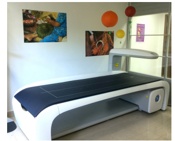
Matou masini fou mo le fa'ata

Momoli atu ai le agaga fa'afetai tele ia'i latou uma na fesoasoani mo le taumafai'ina Matou masini fou mo le fa'ata mai o lenei masini ma e fa'afeiloa'i atu ai, afifio mai le matou ofisa nei, aemaise o a matou uo ma pa'aga masani mai le MOH. E tatala le avanoa e asiasi mai ai pe fa'atalofa mai foi le auaigaluega nei i so'o se taimi!