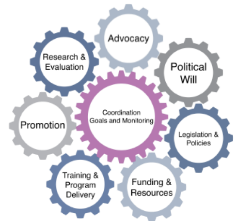
Figure 1. BFGM